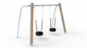
SWINDY 1 0305-004-002