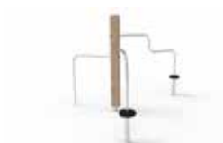
SUALTY - TRIPOD 0301-011-002