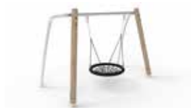
SWINDY 3 0305-006-002