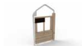
WALLY 2 0306-002-002