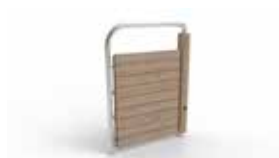
WALLY 1 0306-001-002