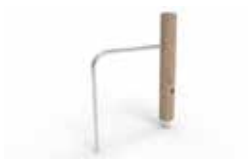
SAULTY - SINGLE 0301-001-002