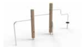
SAULTY - TRIO 0301-010-002